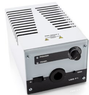
FOT LED without fan

*depending on the ambient temperature, room humidity and the intensity set