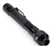
LED hand-held light source