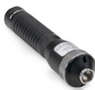
SuperNova LED hand light source