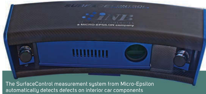
The SurfaceControl measurement system from Micro-Epsilon automatically detects defects on interior car components

surfaces, such as interior automotive parts. SurfaceControl offers a variety of measurement areas ranging from 150 x 100mm 2 to 600 x 400mm 2 , and it takes only a few seconds to capture 3D data for a surface. Various evaluation procedures are available, depending on the nature of the shape deviations being investigated. The 3D data can be used to calculate a flawless virtual cover, or a digital whetstone can be used, similar to a whetstone in a press shop. These methods provide repeatable, objective assessments of deviations from around 5µm to 20µm, depending on the surface. The structured light projection procedure is suitable for all surfaces that diffusely reflect at least part of the light, including steel, aluminum, plastics and ceramics.